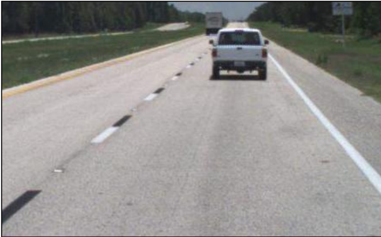
SR 500 OG Rough