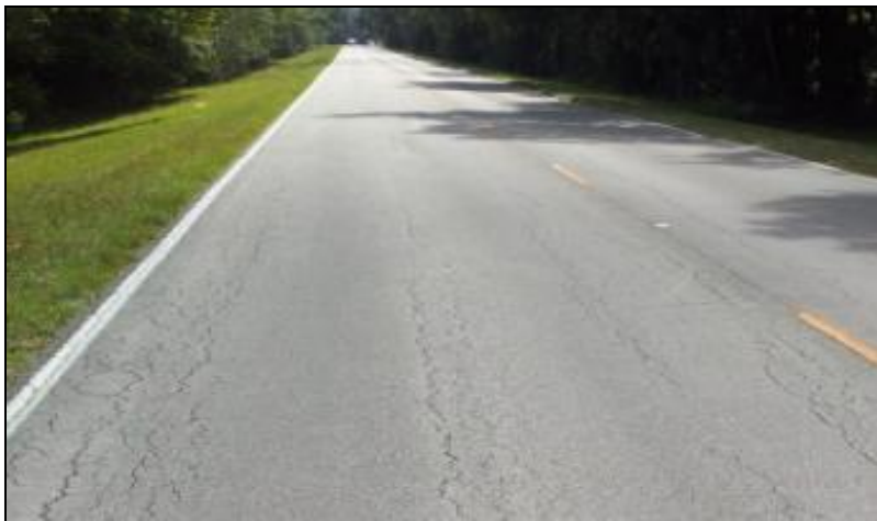
NW 59 Drive DG Rough