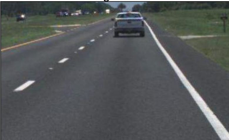
SR 24 OG Smooth