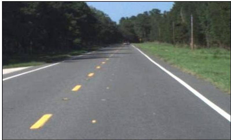
SR 222 DG Smooth